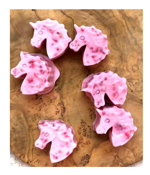
Ingredients for 4 servings

15.3 oz. container whole milk Greek yogurt